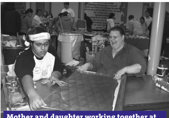
Mother and daughter working together at Cornerstone Christmas Toy Store. Madre e hija trabajando juntas en la tienda de juguetes de Cornerstone.